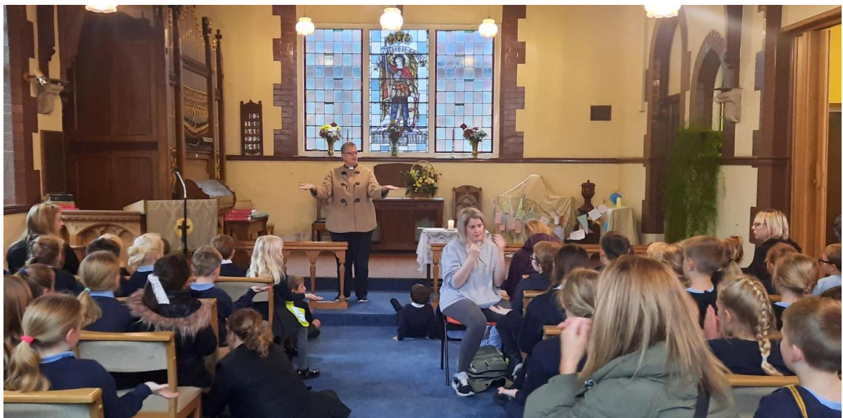
Laying our school wreath on Remembrance day