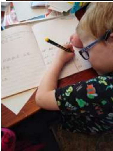
Wrote letters and sentences, played phonics games via the internet.