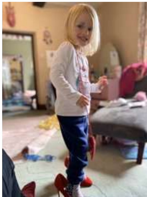
Dressed up in a pretty dress