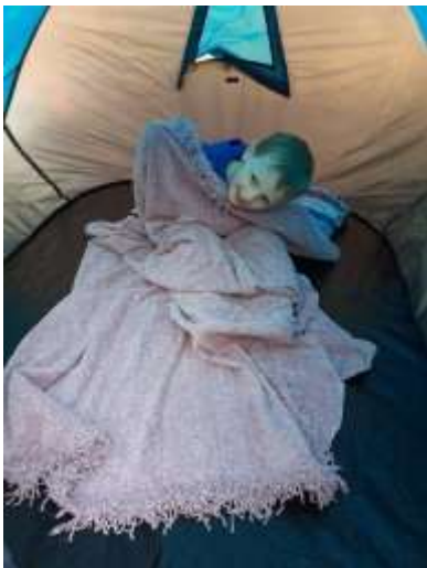
played explorers in a tent build a complicated Lego set with the help of his mummy!