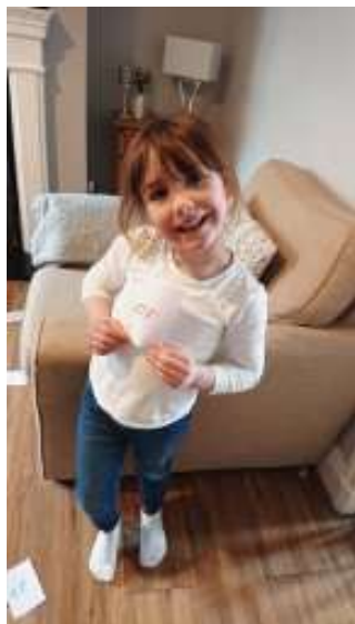
Played chase, the sound game