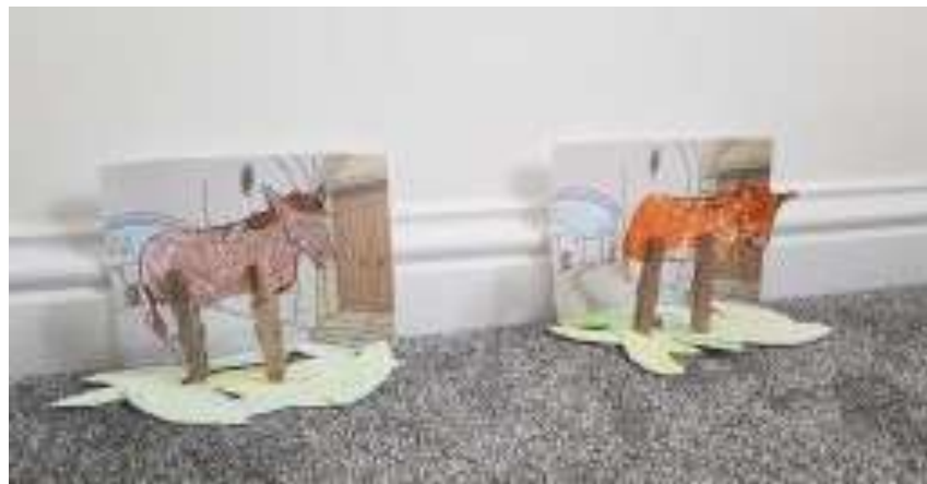
Created characters for stories