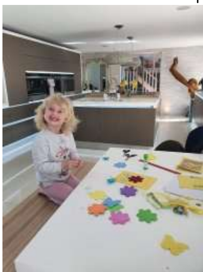
Spent time exploring art activities: