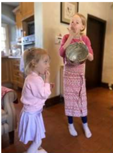
Created 'some yummy cakes' with our big sisters.