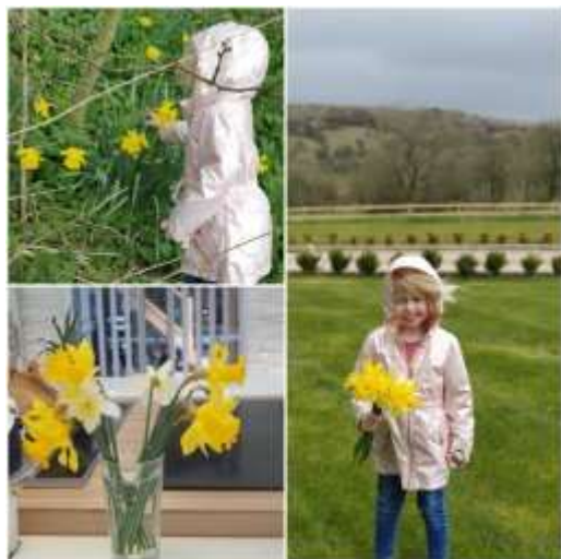
Picked beautiful spring daffodils - yellow flowers are my favourite they remind me of happy days, friendship and joy.