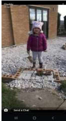
helped build the extension.