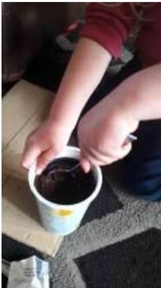
Planted seeds last week (And has been checking them every hour since....) finally some sweet peas have started to grow! One very excited little girl ♡