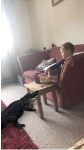
watch out there is an alligator about!