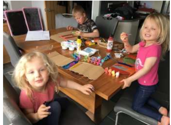
Painted rainbows at home and even painted with our big brother!