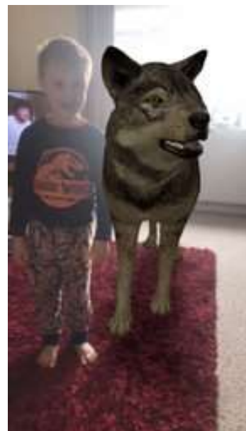
Had 3D animals come and visit us