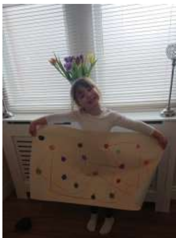
Joined the numbered spots