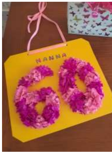
Made a card for a special nana