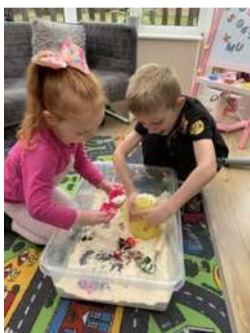
Made moon sand and coloured in a spring flower